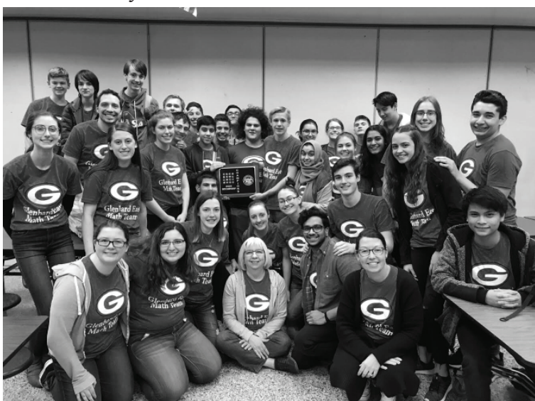
Math team celebrating their win at Upstate 8 Regionals