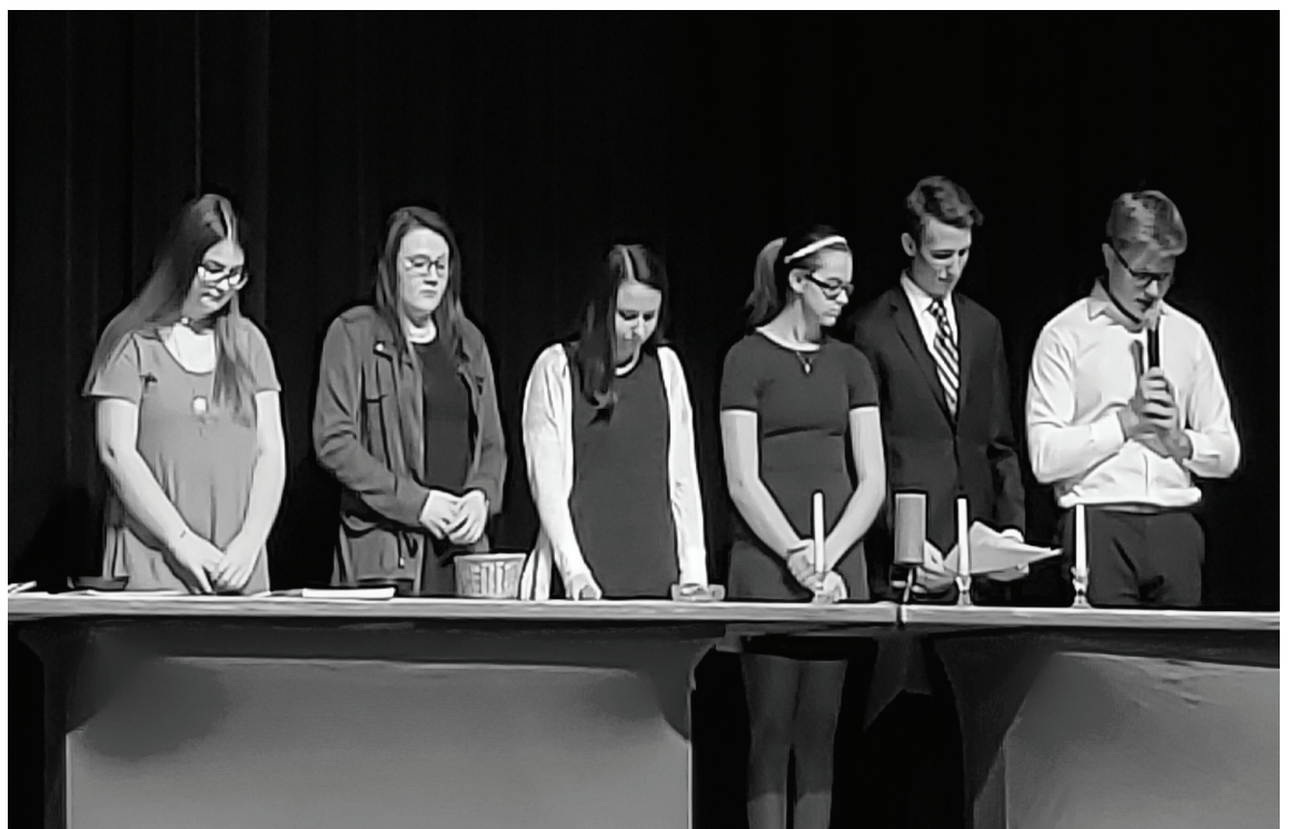
Candle lighting ceremony

Congratulations to all the Honors Society inductees! We're all so proud of you and hope that you all will continue to strive for success, and to achieve it as well.