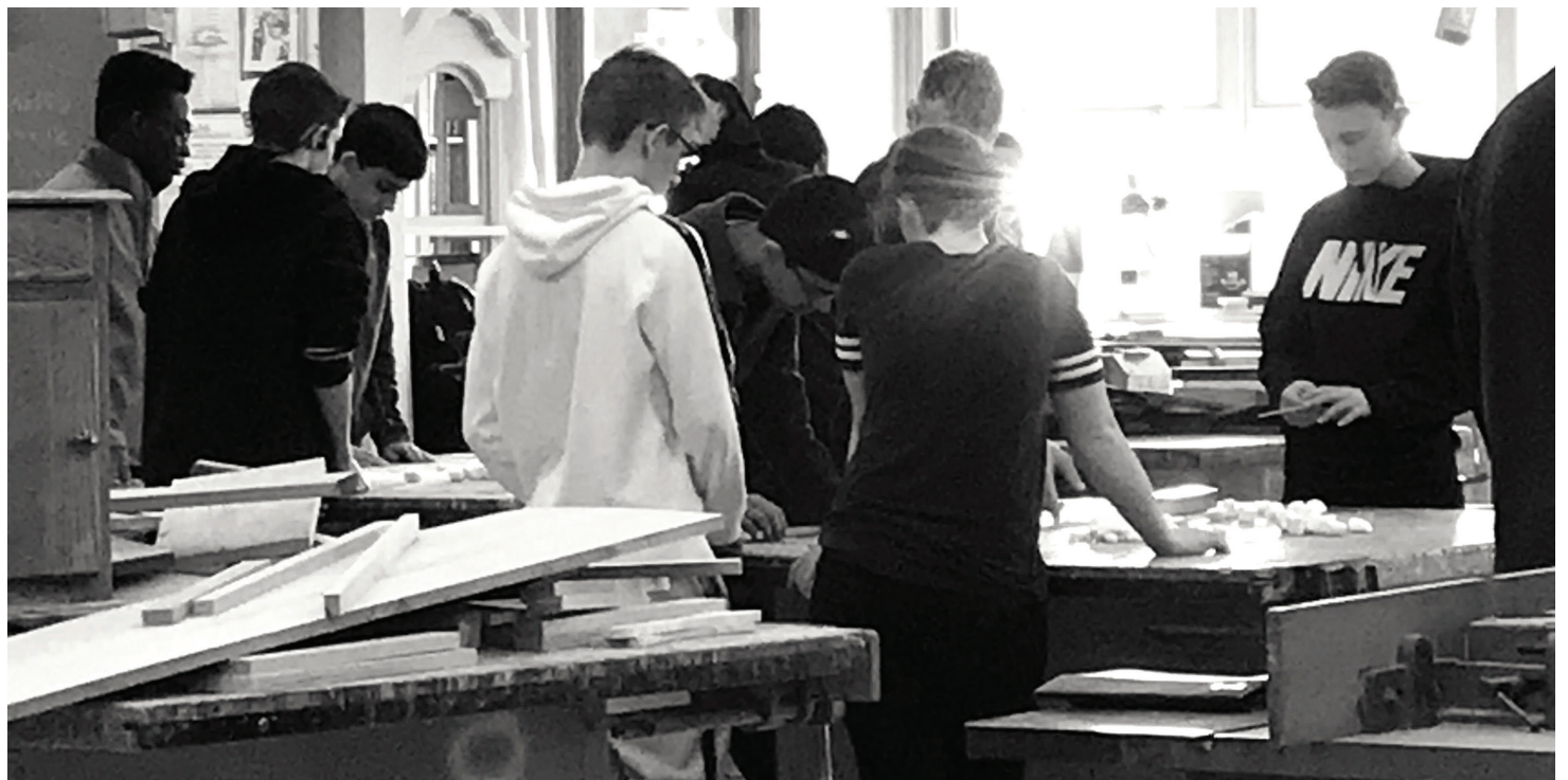
Various students working on their projects for the seminar, Photo by Eva Brooks

Our engineering classes recently got a special treat that built cooperation along with some friendly competition. Getting into groups of five, they were instructed to build a foot long bridge using the table and two pieces of wood. The classes of 4th and 5th period cooperated in groups of four or five, and worked together to learn and grow as engineers and students. Given real hands-on experience, the students all thrived in their environments. The creative energy in the room was electrifying. All of the students worked together to create their own designs and learned more about each other and themselves. Through our community at East, we can personally develop. We are East!