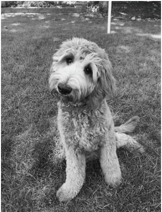
Here are some picture of her puppy, Eleanor (Ellie)! She’s an 8 month labradoodle. Isn’t she adorable? Her talent is digging holes in the backyard and likes to eat shoes. She’s still a puppy so they are still training her. If you want your pet to be featured in the ECHO, please send their name and a talent to 1211040@glenbard.org or DM our twitter @Echonews- paperG!

Pictured to the bottom left is Ginger, her Granddog 7.5 purebred Miniature Dachs- hund. Comes to Grampa Day Care daily. Talent: she loves to Snuggle! Eats best for her Nana.